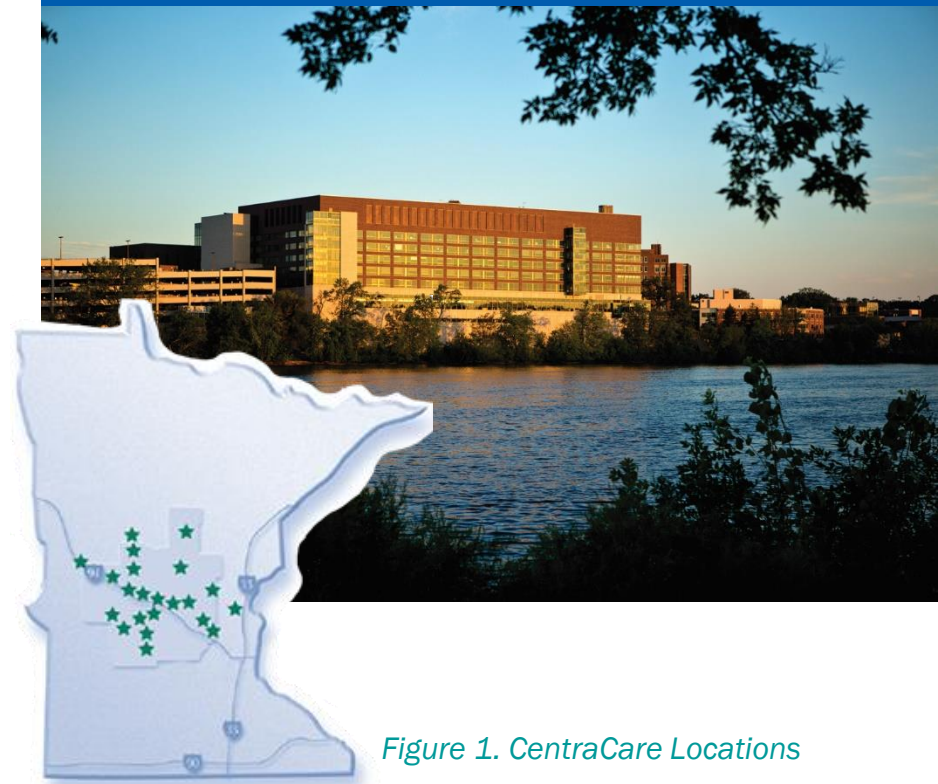
Figure 1. CentraCare Locations